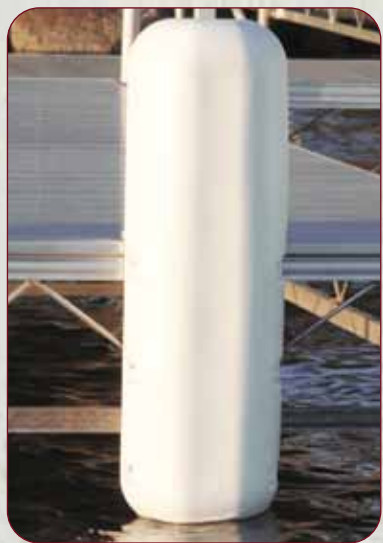
#300027 - 10" W VERTICAL BUMPER