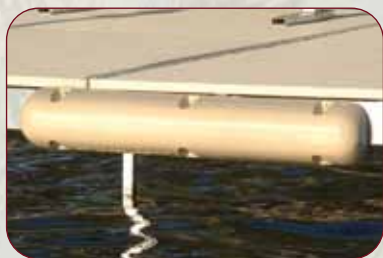
#300025 - 10" W HORIZONTAL BUMPER = 24" Surface / 24" L x 10" W x 6" D