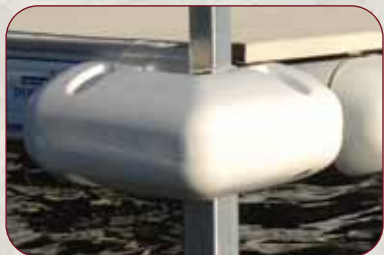
#300023 - 10" W CORNER BUMPER = 36" Surface (18" each side) x 10" W x 6" D

Wave Armor Universal Dock Bumpers are constructed of durable poly-vinyl material and provide superior strength with unmatched quality. Universal Dock Bumpers easily mount to any dock utilizing the included kit fasteners. Available Color: White.