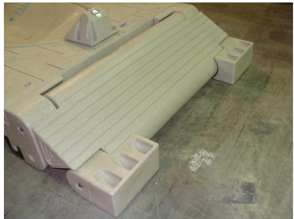
Completed Entrance Deck