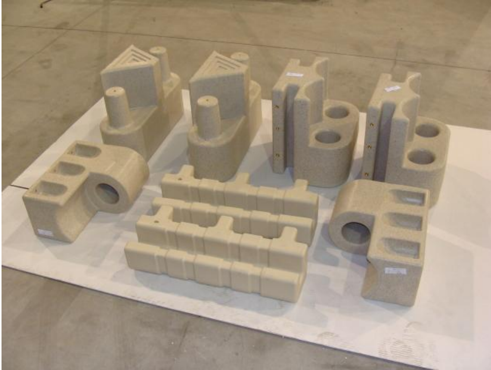
Plastic parts included in kit.

Follow the instructions above, substituting the universal hinge (Part Q) for the port front and dock hinges (Part O) that attach to the dock in Steps 1–4. Attach the universal hinges to the existing dock in an appropriate manner depending on the dock type.