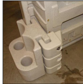
Port Front and Dock Hinge Part O) and C-Clamp Attached to Front of Wave Port