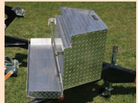
TA0150 Storage Rack (Requires TA0149 Storage Box) This 41" x 10.5" matching aluminum tray mounts to the back of the box for additional storage.