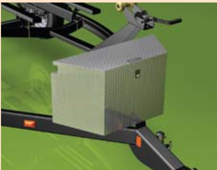
TA0149 ShoreLock'r II for PWC Double Trailer