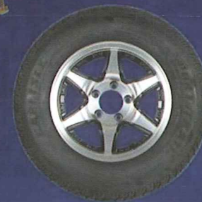
Aluminum/ Galvanized Rims 10", 13", 14"(Galv.) 13" or 14" (Alum.)