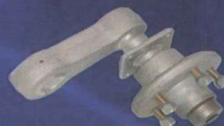
Torsion Axle 3750# Torsion axle, Galvanized Axle Body, Arm, and Hubs, Sure Lube Hubs