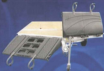
Spare Tire Carrier