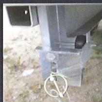
Roller Guided Ramps (VR Only) All V-front trailers come with a roll out ramp assembly. The roll out design allows for locking of the ramp and eliminates the ramp from rattling.