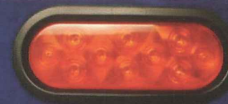
LED Grounded Compact Lighting