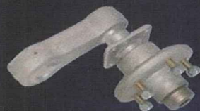
Torsion Axle 2200# Galvanized Axle Body, Arm, and Sure Lube Hubs